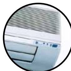
Automotive air conditioning